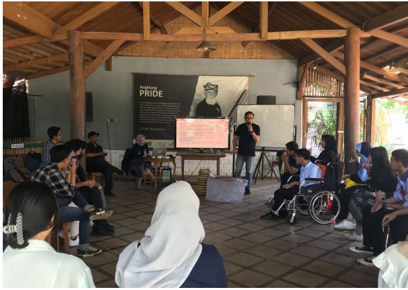
GENPEACE Project workshop in Bandung.