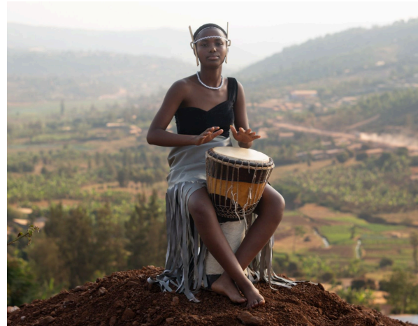
Production of "Mental Health at Home".